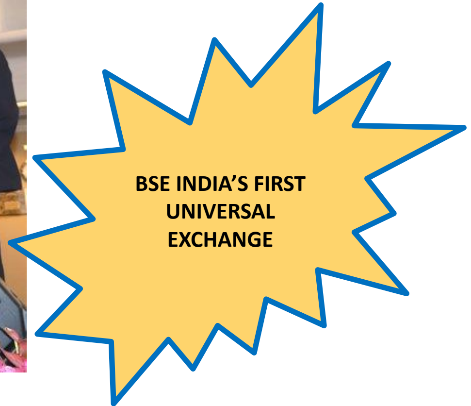
Launch of commodity Derivate Segment on BSE October 1, 2018