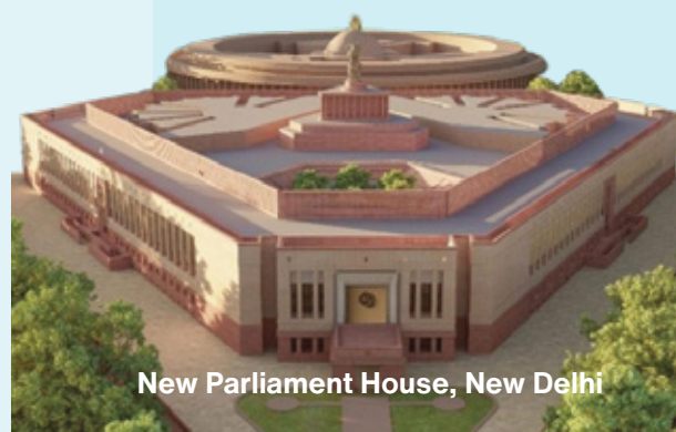
New Parliament House, New Delhi