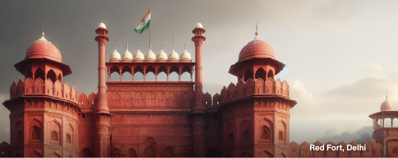
Red Fort, Delhi