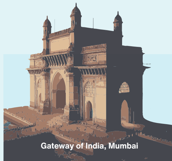
Gateway of India, Mumbai

http://trident.photowebasia.com/bandra-kurla/index.html