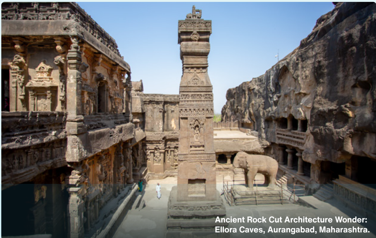
Ancient Rock Cut Architecture Wonder: Ellora Caves, Aurangabad, Maharashtra.

(Complementary buffet breakfast at the 24/7 – All day dining restaurant, wi-fi facility, room tea/coffee available through electric tea/coffee maker)