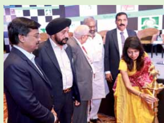
Lighting of the lamp