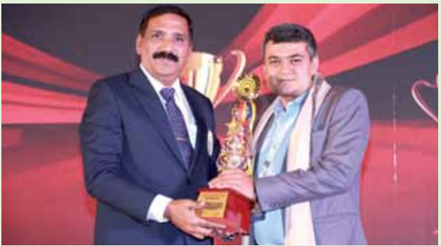
Silver Sponsor Award to Gujarat Cotton Corporation.