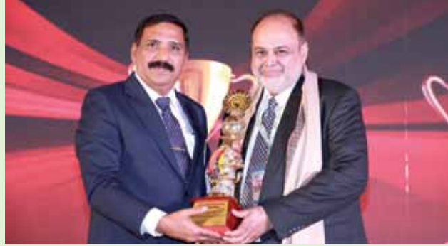
Silver Sponsor Award to Tayal Sons Ltd.