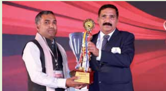
Silver Sponsor Award to Mahyco Monsanto Biotech Pvt. Ltd.