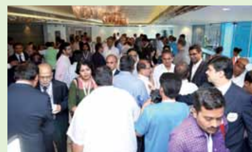
Registration in progress