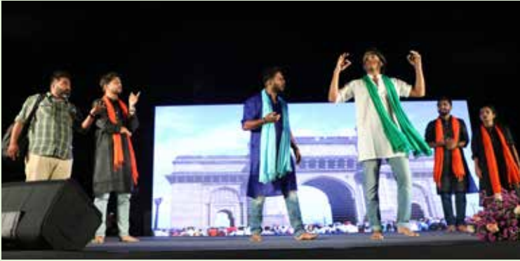
Music, dance and message - all in a skit