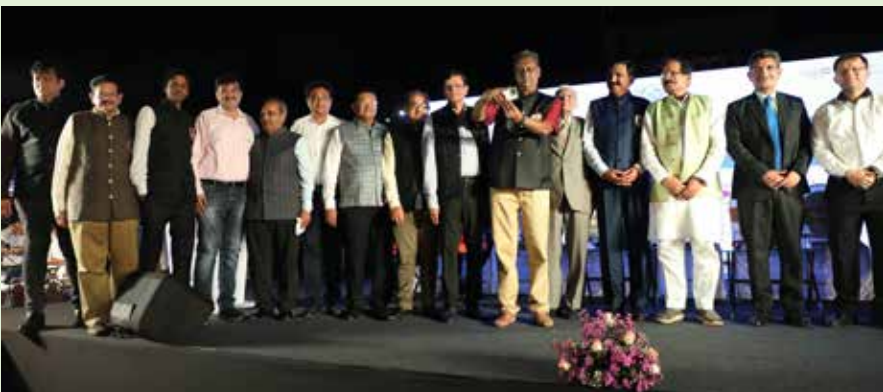
An event well done - MbPA and CAI team