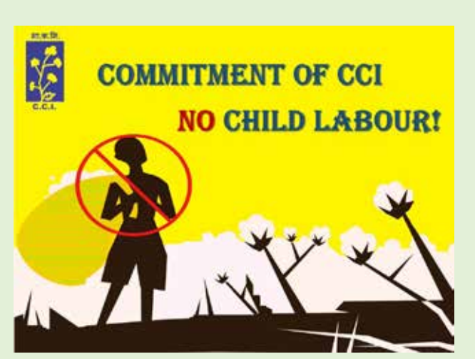
CCI says no to child labour