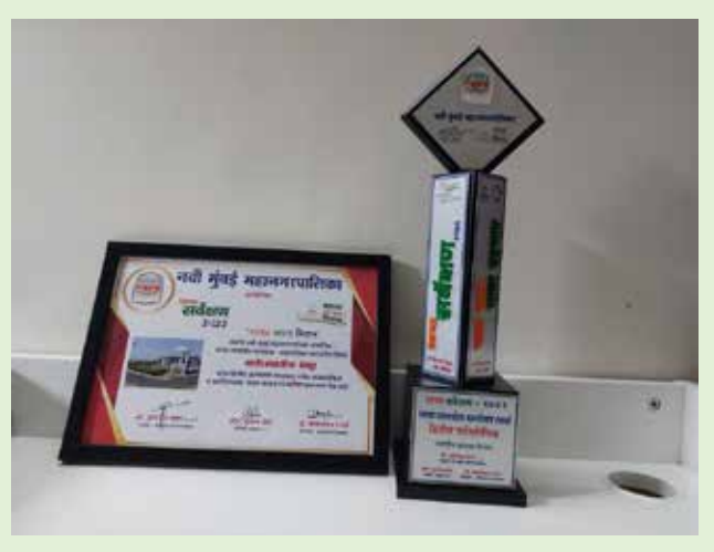
Awards for Swachh Bharat Abhiyan

aspects and wherever required immediate corrective action is being taken on a priority basis. Thus, besides maintaining the cleanliness of all the office premises and surroundings, CCI has disposed-off all un-used/un-serviceable material, scrap etc, weeded out all old records and repaired/replaced of old furniture as per the laid down guidelines.