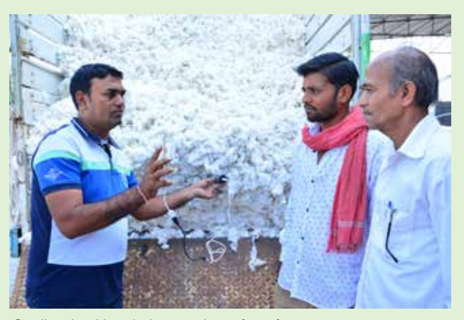
Quality checking during purchase from farmers