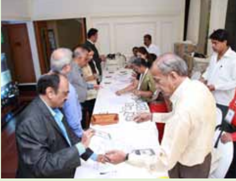
Registration began at 5pm on 6th March and continued the next morning as well.