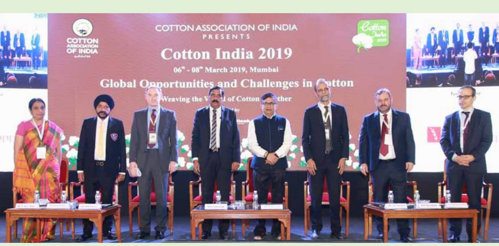
Dignitaries on the dias stand up for the National Anthem.