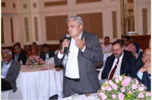
Q & A session